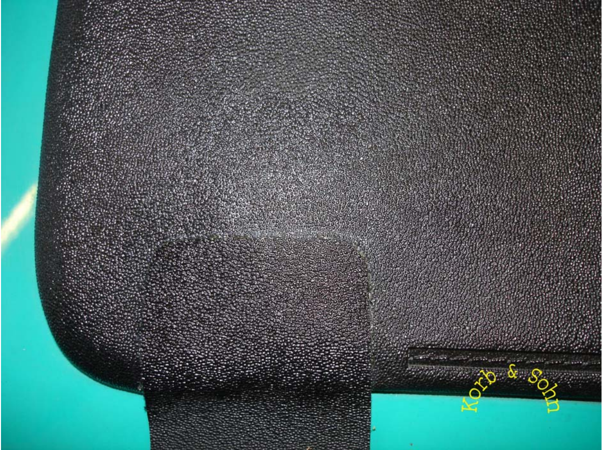
1.2in. are enough.