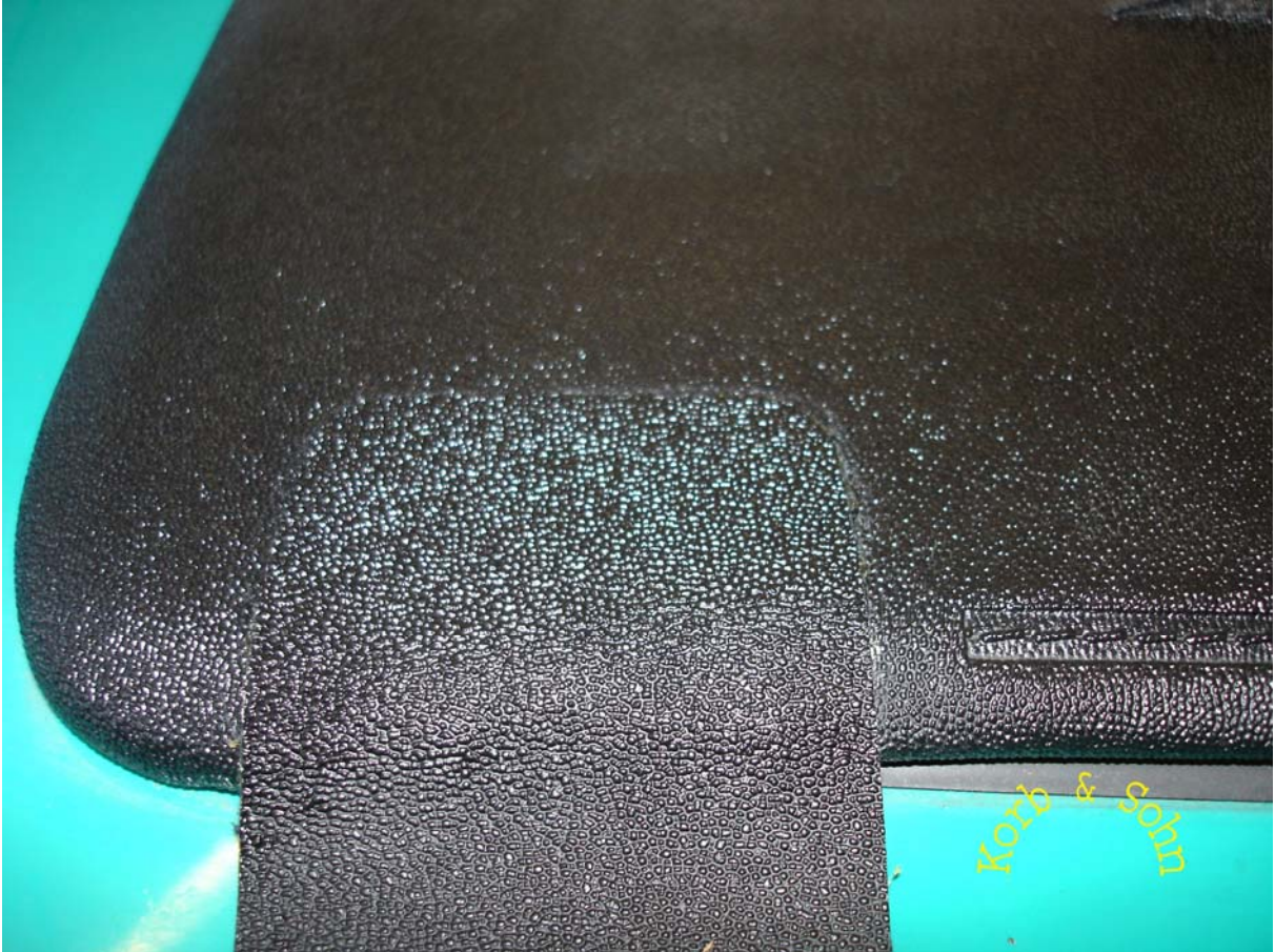
Now you have to reduce surplus.