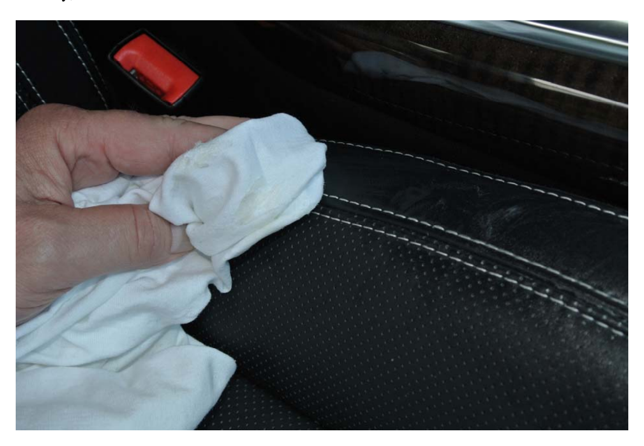
Also here, the corners and wrinkles must be treated with the leather care.