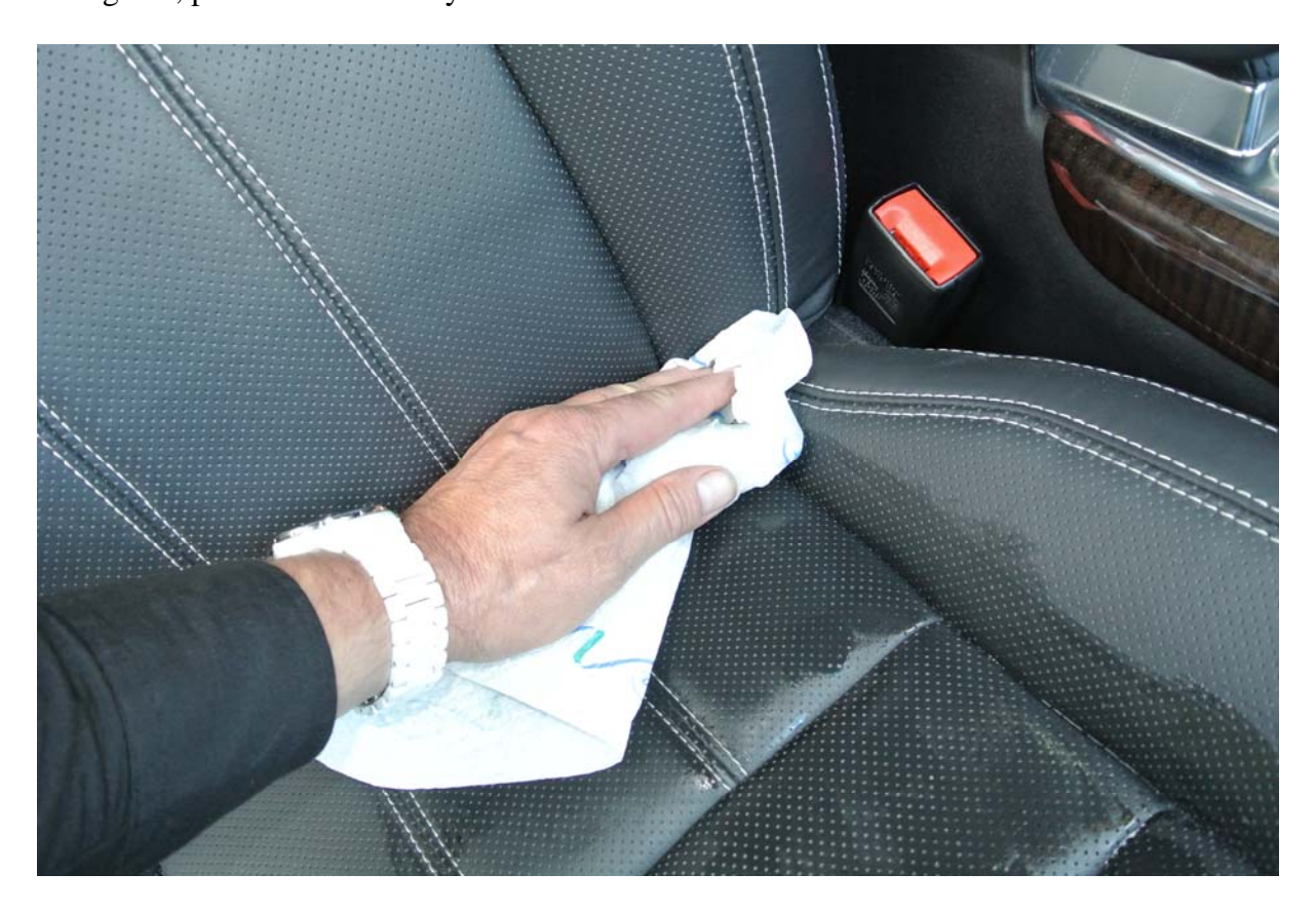
Now rub dry.

Doing this, please clean roundly the inaccessible.