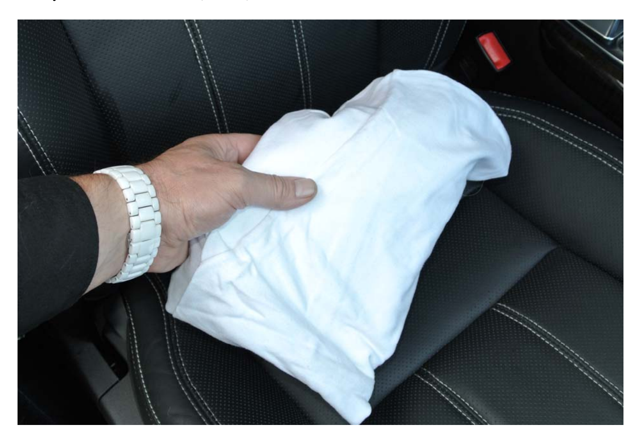
Now apply the leather balm on the cloth.