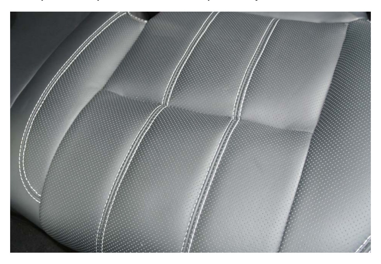
Here the leather, 30 minutes after the treatment. The shine disappears gradually.

The silky shine shows you that the care oils are not yet soaked up from the leather.