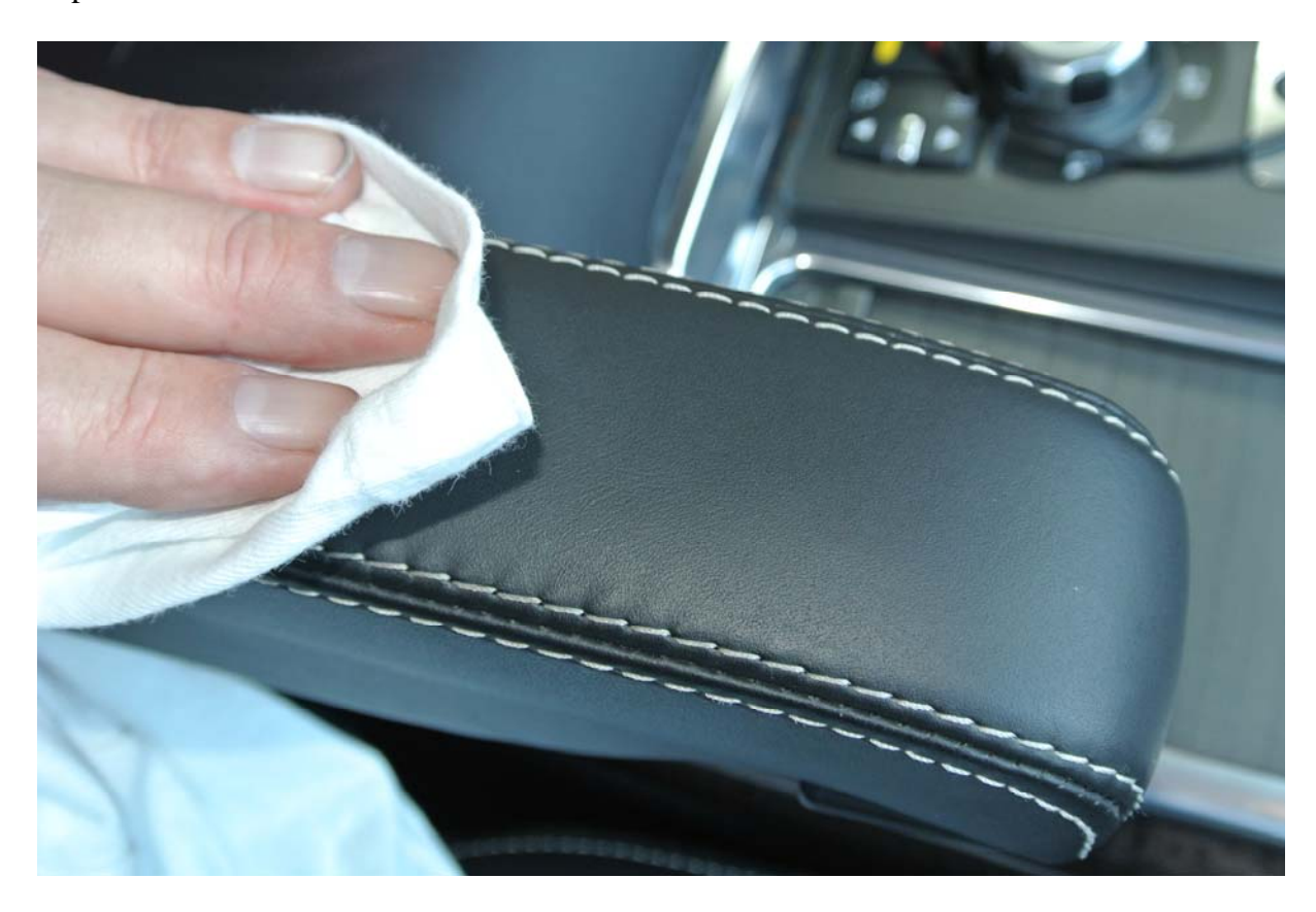
Here you can easily see the silky shine, which develops after rubbing on the balm.

Due to the neutrality of color of this leather balm, even white seams stay white without any impairment.