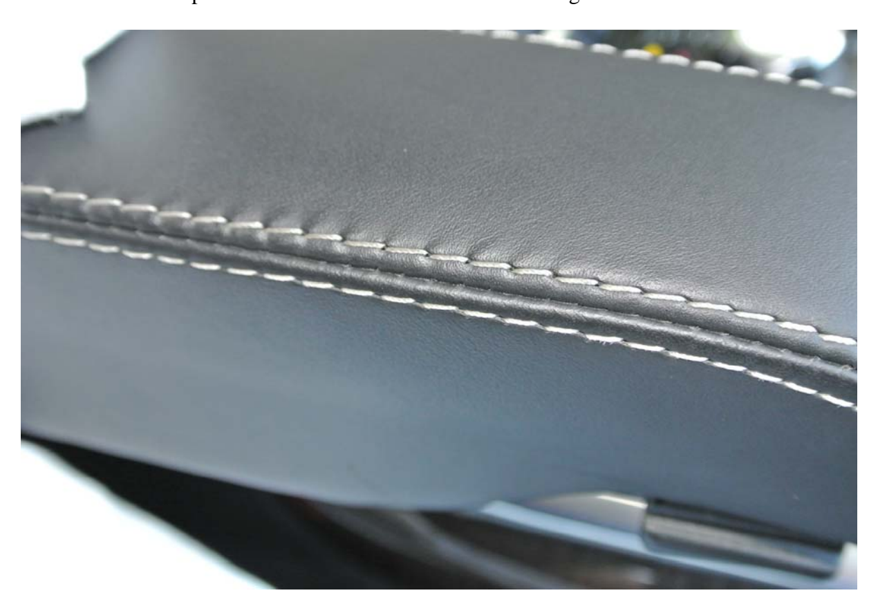
After 30 – 90 minutes, the possibly unneccessary balm can be polished away.

Now the surface is protected from outside influences for a long time.