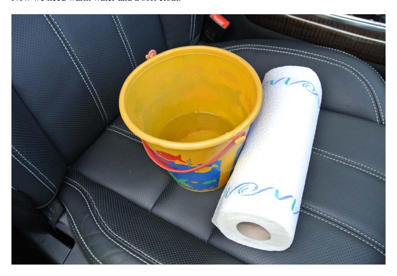
With the moist cloth, we collect the dust and the bigger dirt.

Now we need warm water and a soft cloth.